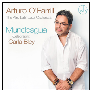
Mundoagua (Celebrating Carla Bley) Arturo O'Farrill/The Afro Latin Jazz Orchestra (ZOHO)

Consisting of three multi-part extended pieces for jazz orchestra, Mundoagua (Celebrating Carla Bley) bookends two Arturo O'Farrill works around Carla Bley's Blue Palestine , her last completed work before she died in October 2023—commissioned by O'Farrill for his Afro Latin Jazz Orchestra. But the entire recording is a tribute to Bley, as the leader explains in his liner notes: Bley “discovered” a teenage O'Farrill playing piano in a band in upstate New York and recruited him for her Jazz Composers Orchestra. He notes, “Carla is the biggest influence on my work as a composer; she said the three most important ingredients a composer can have are curiosity, integrity and accuracy.” O'Farrill also continues in the progressive, liberal tradition of protest music exemplified by Bley's work for Charlie Haden's Liberation Music Orchestra, saying “There are those who think musicians should just swing and play pretty music...I am not one of those. I have too much respect for human beings and for their intelligence”.