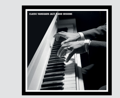
Classic Vanguard Jazz Piano Sessions Various Artists (Mosaic)

Producer John Hammond worked with jazz artists and record labels, although it was his love of classical music and high-fidelity recording that led him to produce jazz records for the classical label Vanguard. A magazine article in which Hammond scolded record labels for their poor recording technique led to an invitation for him to produce a new sublabel, Vanguard Jazz Showcase. The excellent acoustics of the recording venue, Masonic Temple in Brooklyn, plus their single microphone technique, led to numerous outstanding 10-inch records made between 1953-58, before the venture ended. This is the second Mosaic boxed set of highlights, with all sessions being complete rather than scattered over more than one release.