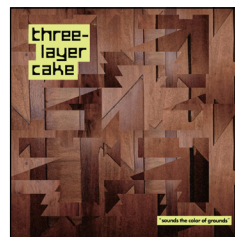
Sounds the Color of Grounds Three-Layer Cake