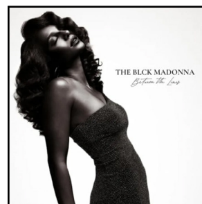
Between the Lines The Black Madonna (Noir Collective/Downtown) by Marilyn Lester

For more info visit mackavenue.com . McBee is at Blue Note May 9-10 (with The Cookers ). See Calendar .